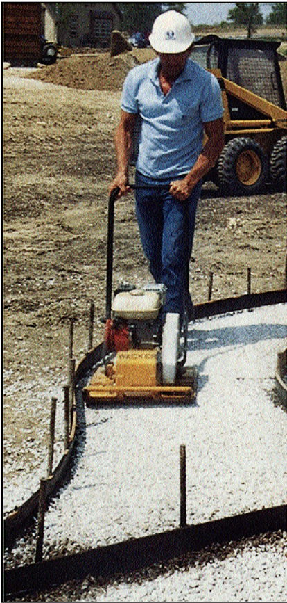
Use vibrating plate compactors for granular soils or base materials. Low-frequency vibrators work best for coarse-grained granular materials.

cohesive soil. But don't make the mistake of just dumping a load or two of gravel, crushed stone, or sand into the hole without compacting it. Whether the material is of a single size such as pea gravel, or a graded material, it still has to be compacted. A thick, uncompacted layer of granular material may settle an inch or more.